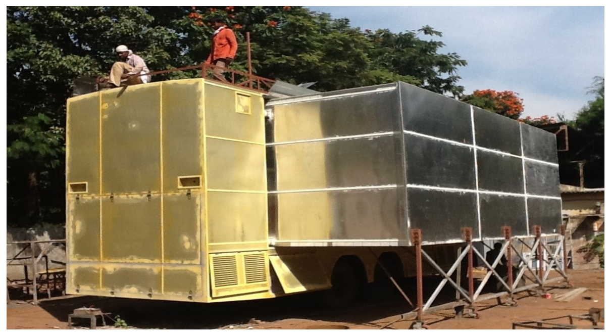
Figure 3 Fully Expanded Auditorium on Five landing wheels (Major Guiding Wheels are partly seen at Top & Bottom)