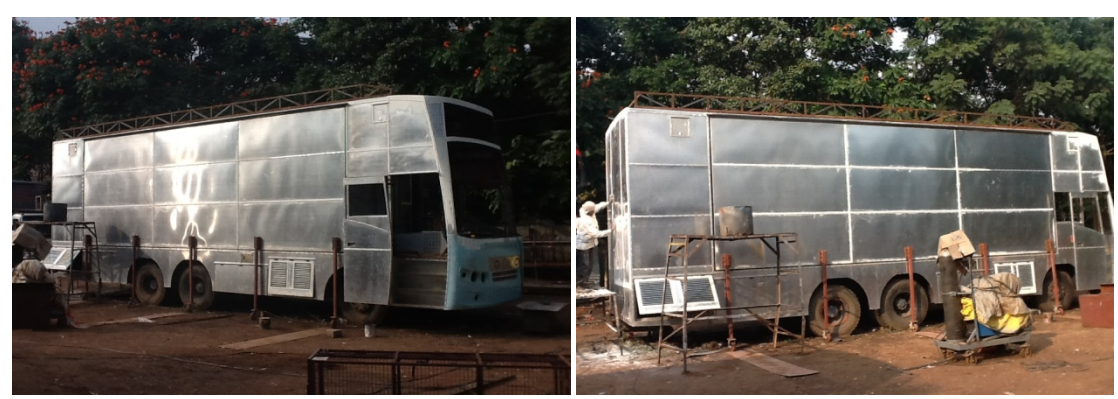
Figure 2 Five landing wheels which were assembled/attached to the outside body of expandable portion before the expansion

Expandable Portion of the Mobile Auditorium towards the left (away from the main floor) and duly supported by five landing wheels which were assembled/attached to the outside body before the expansion at sprit level as shown in figure 2 & 2a. The entire expandable portion gently slides and gets guided on array of 244-272 numbers of Teflon Wheels having 50 mm diameter (allowing the stainless steel plate covered bottom floor) which ensures the 2000-2500 kg load of expandable portion smoothly with reduced friction. Fully Expanded Auditorium on Five landing wheels is shown in figure 3. Major Guiding Wheels (6 numbers on each side, total 12 wheels having 150 mm diameter) which are mounted at the inner end of "X" beam fixed on either sides which provide additional support to expanding portion also sliding between rigid stainless steel plate guides mounted at the major stationary portion of truck are partly seen at Top & Bottom in figure 3 & 3a.