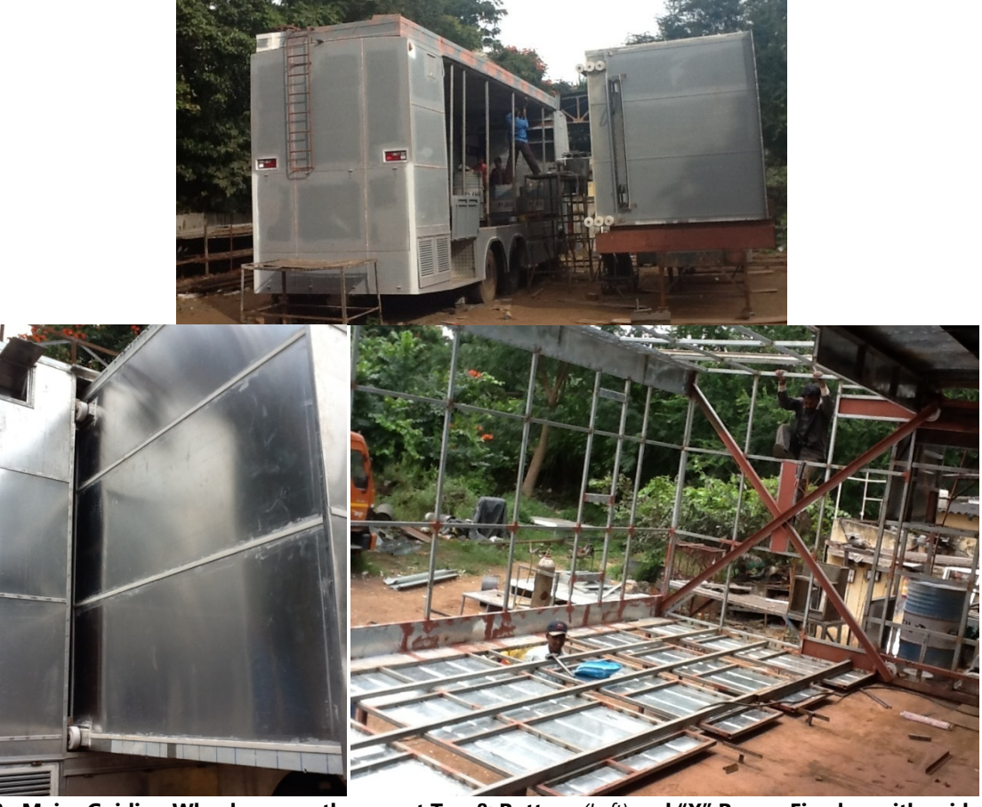
Figure 3a Major Guiding Wheels are partly seen at Top & Bottom (Left) and "X" Beams Fixed on eitherside (Right)