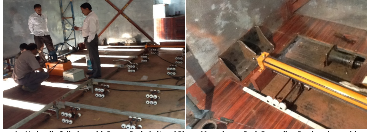
Figure 1a. Hydraulic Cylinders with Power Pack (Left) and Piston Mounting to Push Expanding Portion along with array of Teflon Wheels up & down to hold the bottom platform intack during sliding in/out (Right)

The first functional Prototype has been fabricated on 35' Standard Truck Chassis with an Expanding Area (25'x8') using 2 Hydraulic Cylinders as shown in above figure 1 & 1a in Signal Red Colour. These cylinders push the