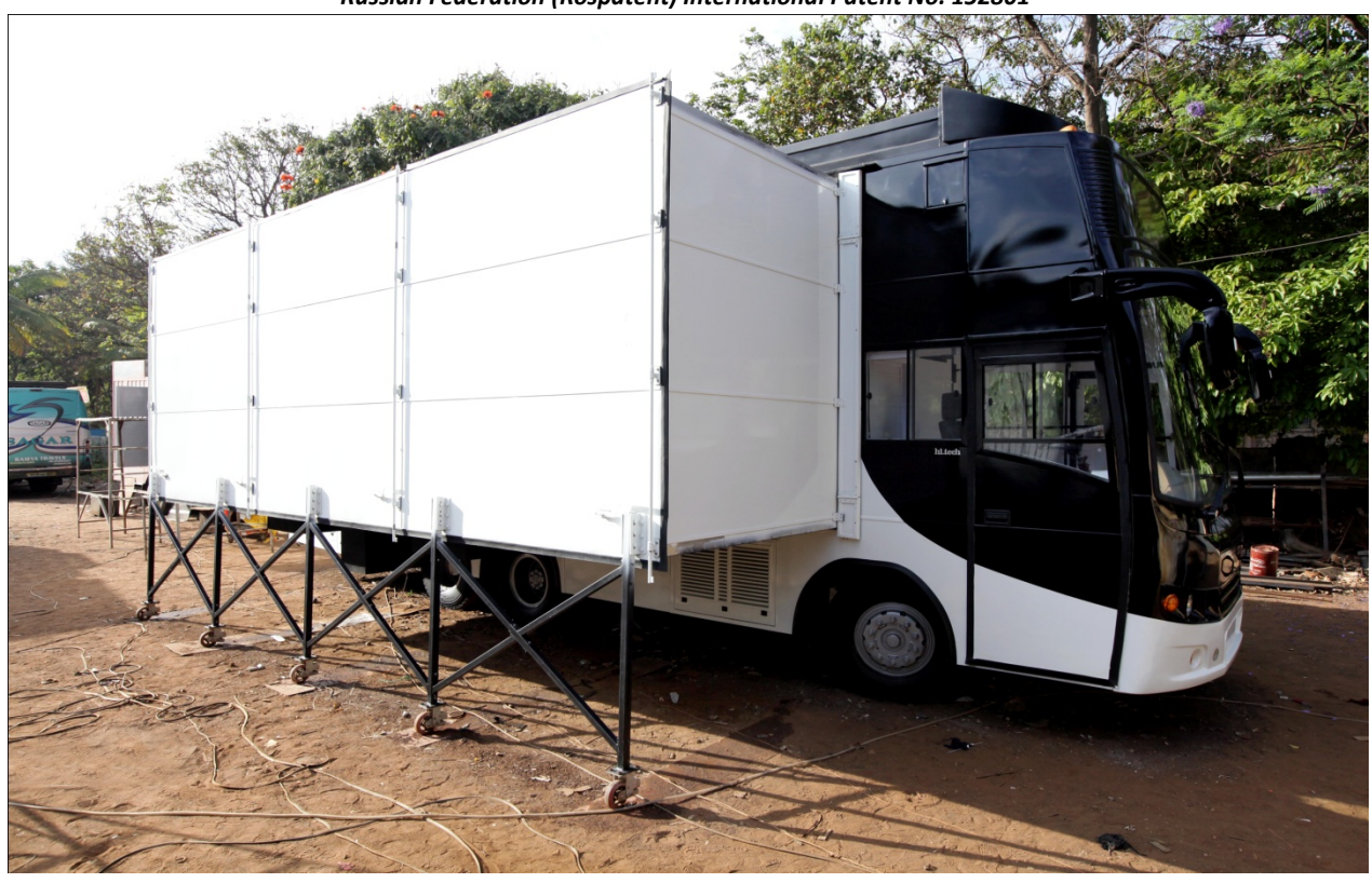
Russian Federation (Rospatent) International Patent No. 152801