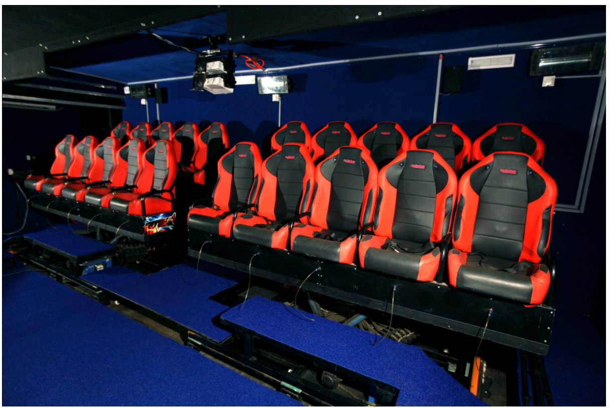
Russian Federation (Rospatent) International Patent No. 152801