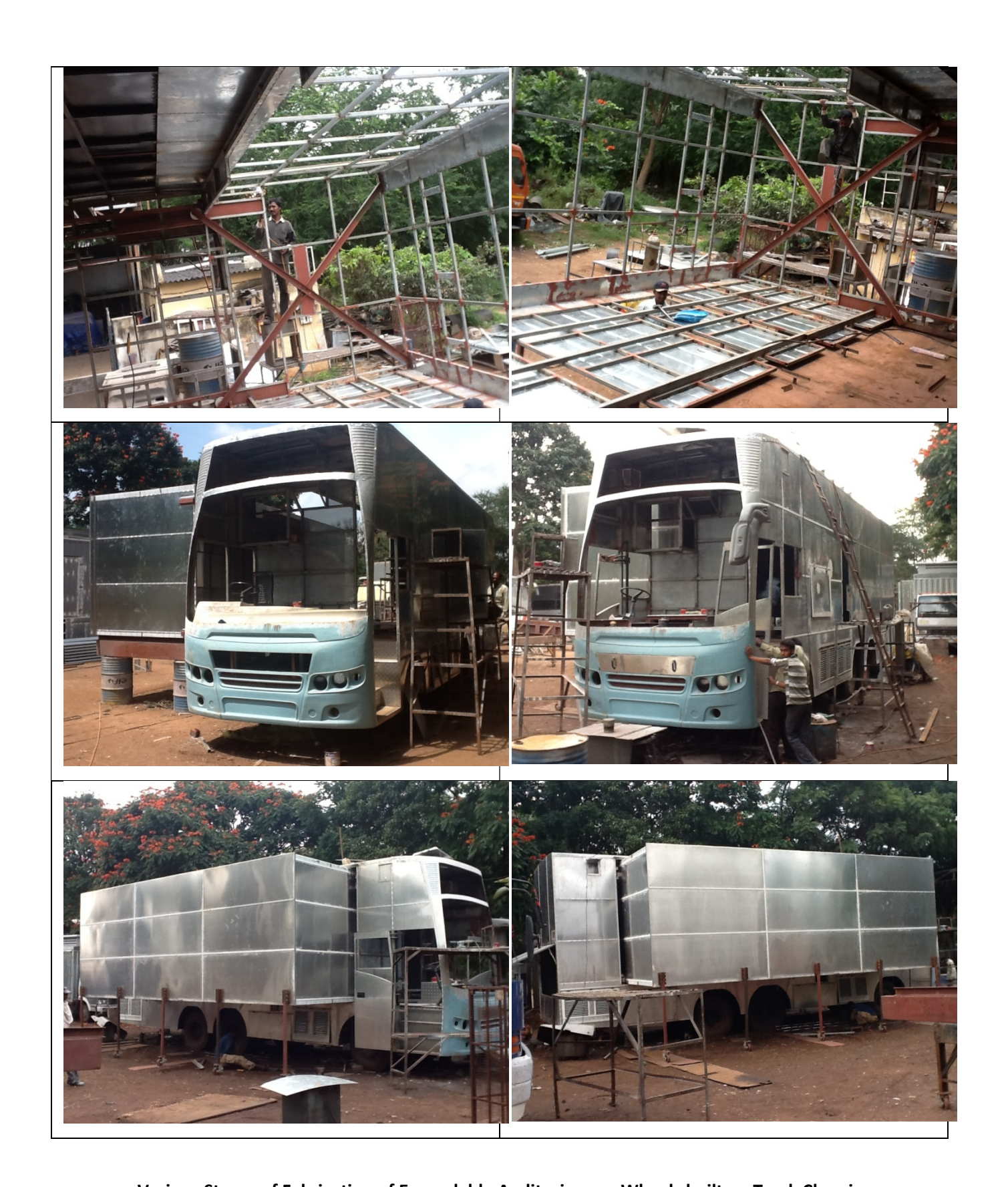
Various Stages of Fabrication of Expandable Auditorium on Wheels built on Truck Chassis