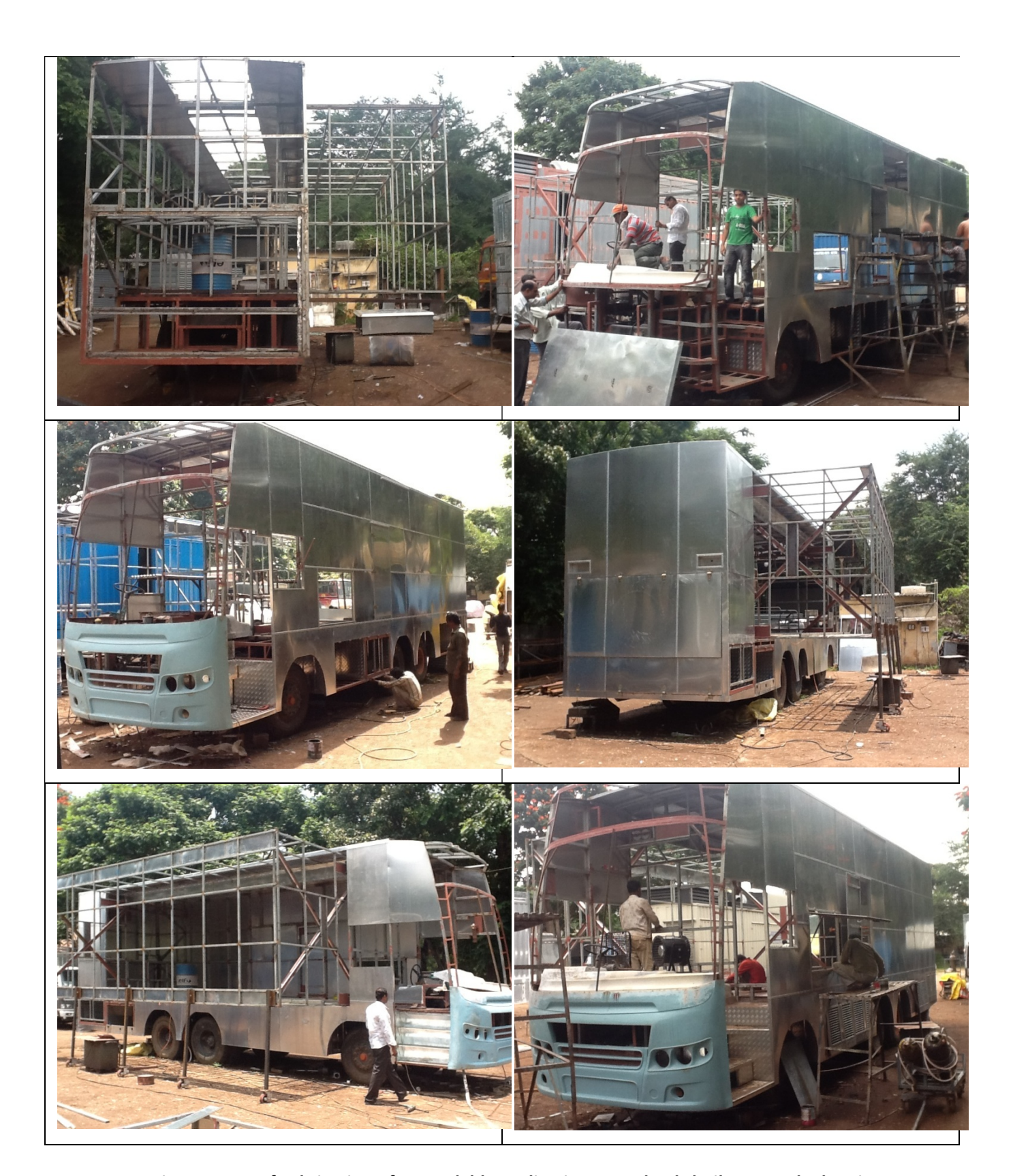
Various Stages of Fabrication of Expandable Auditorium on Wheels built on Truck Chassis