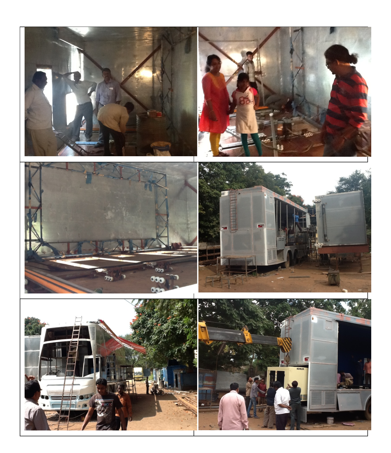
Various Stages of Fabrication of Expandable Auditorium on Wheels built on Truck Chassis