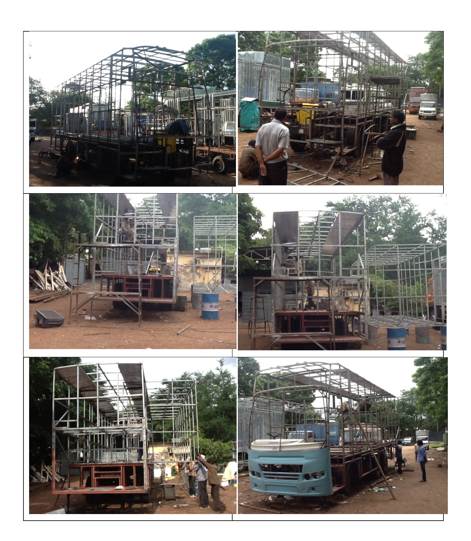
Various Stages of Fabrication of Expandable Auditorium on Wheels built on Truck Chassis