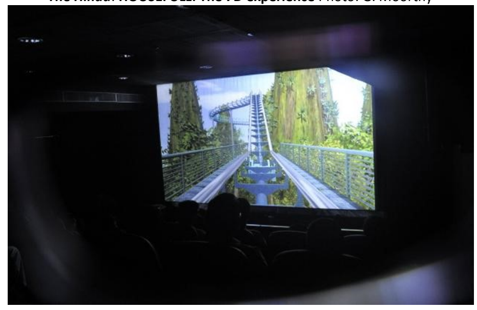
The Hindu: ENTERTAINING: The 7D experience.