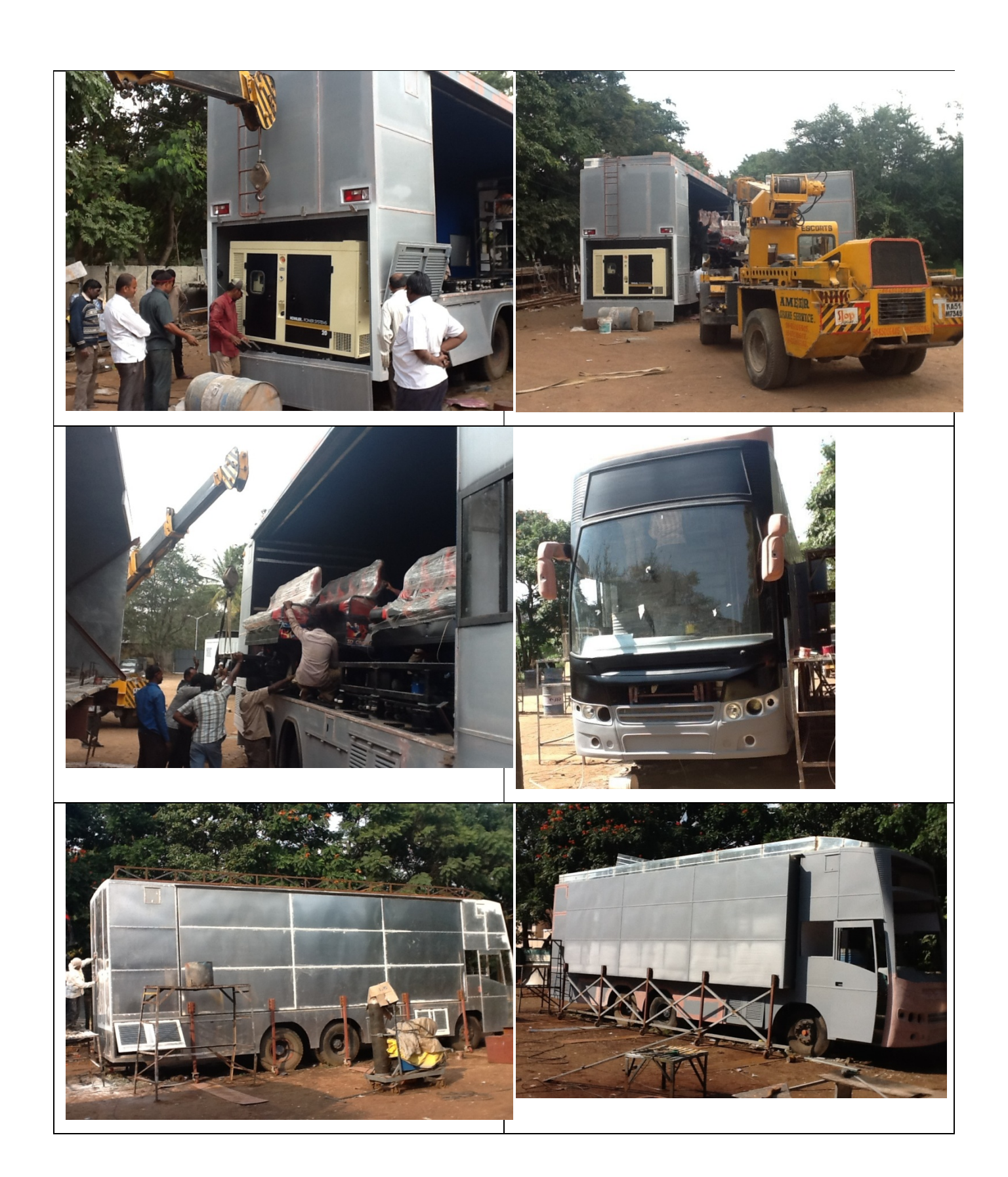
Various Stages of Fabrication of Expandable Auditorium on Wheels built on Truck Chassis