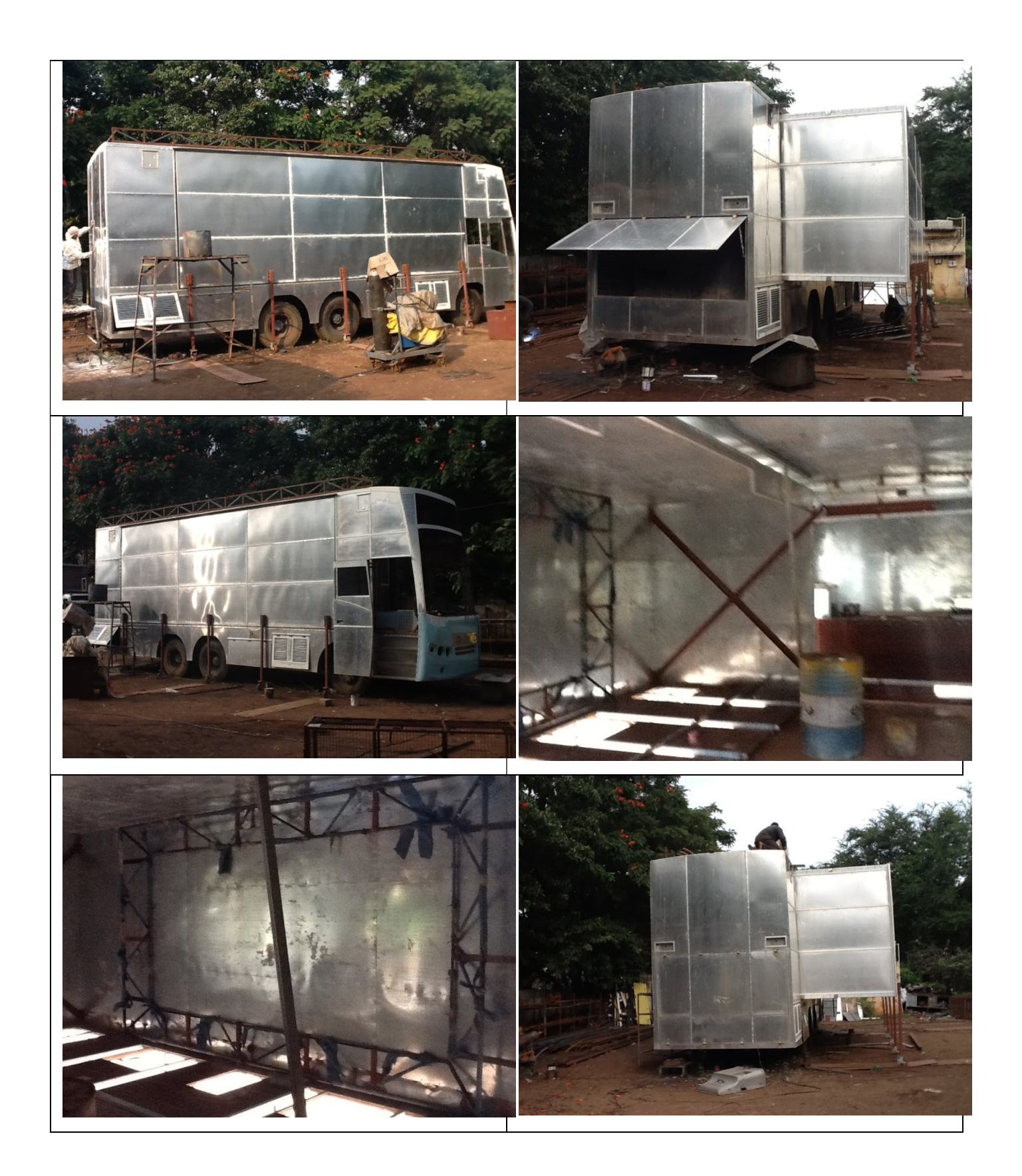
Various Stages of Fabrication of Expandable Auditorium on Wheels built on Truck Chassis