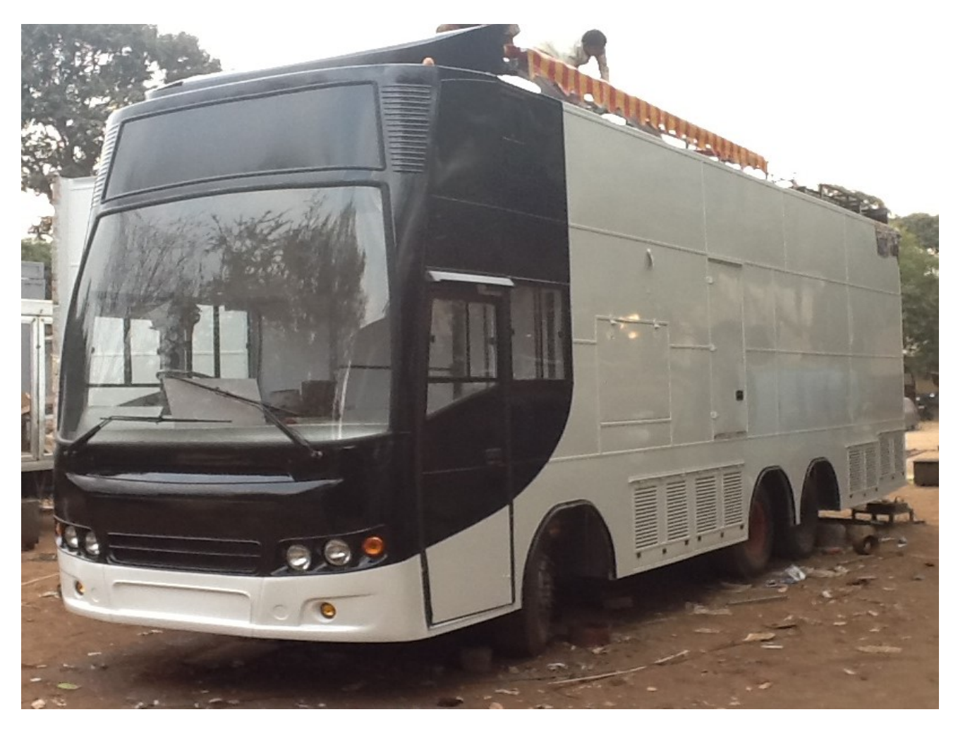
Final Stage of Fabrication of Expandable Auditorium on Wheels built on Truck Chassis