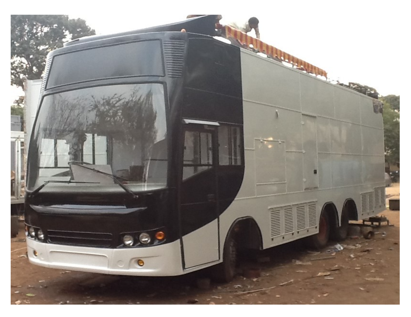
Final Stage of Fabrication of Expandable Auditorium on Wheels built on Truck Chassis

Please open the separately attached Video Files to see the actual movement of Expandable Portion of Auditorium for your reference.