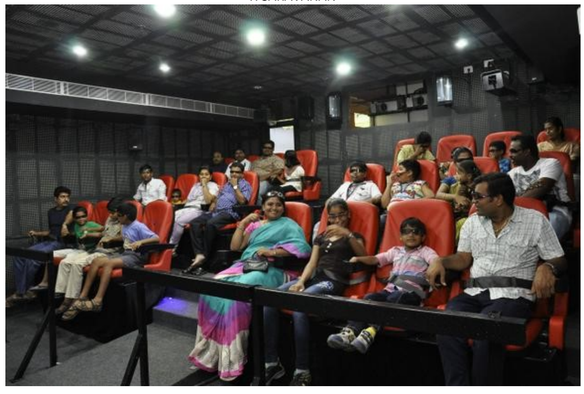
The Hindu: HOUSEFULL: The 7D experience