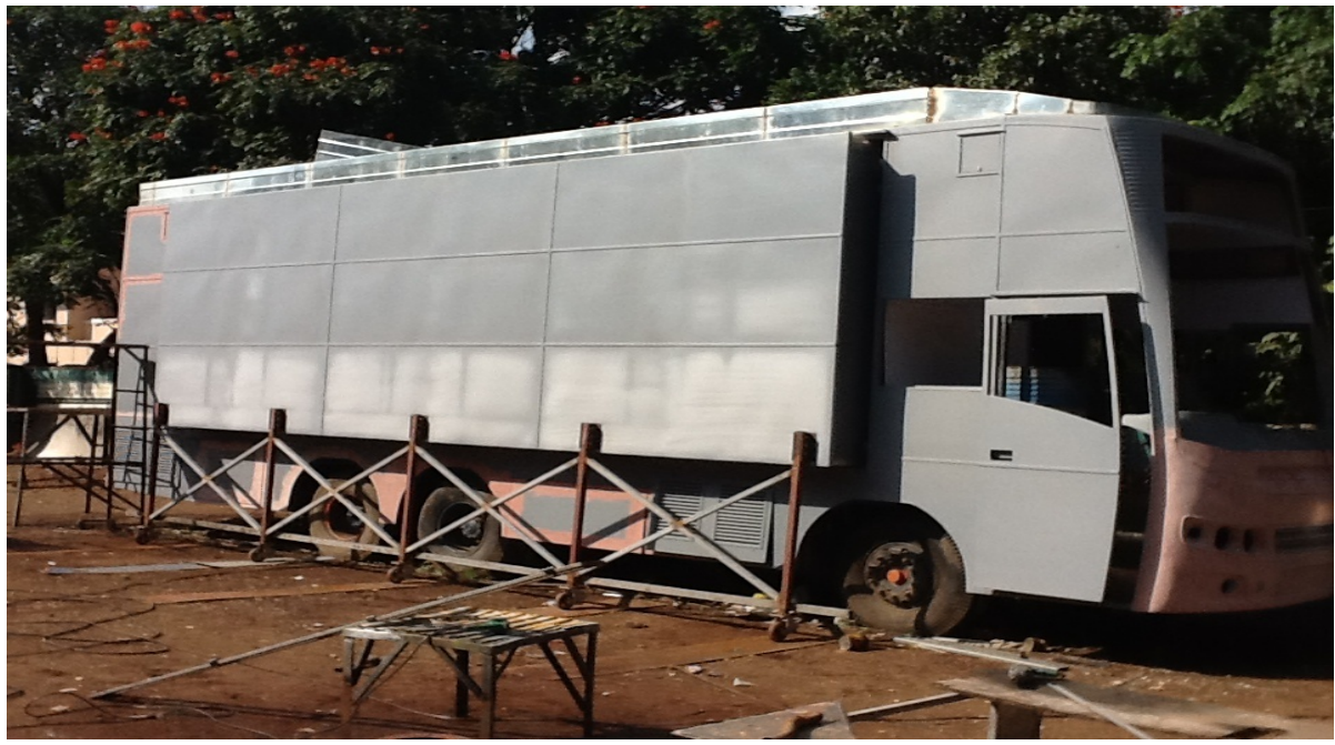
Figure 2a Five landing wheels which were assembled/attached to the outside body of expandable portion before the expansion is moving outward during expansion