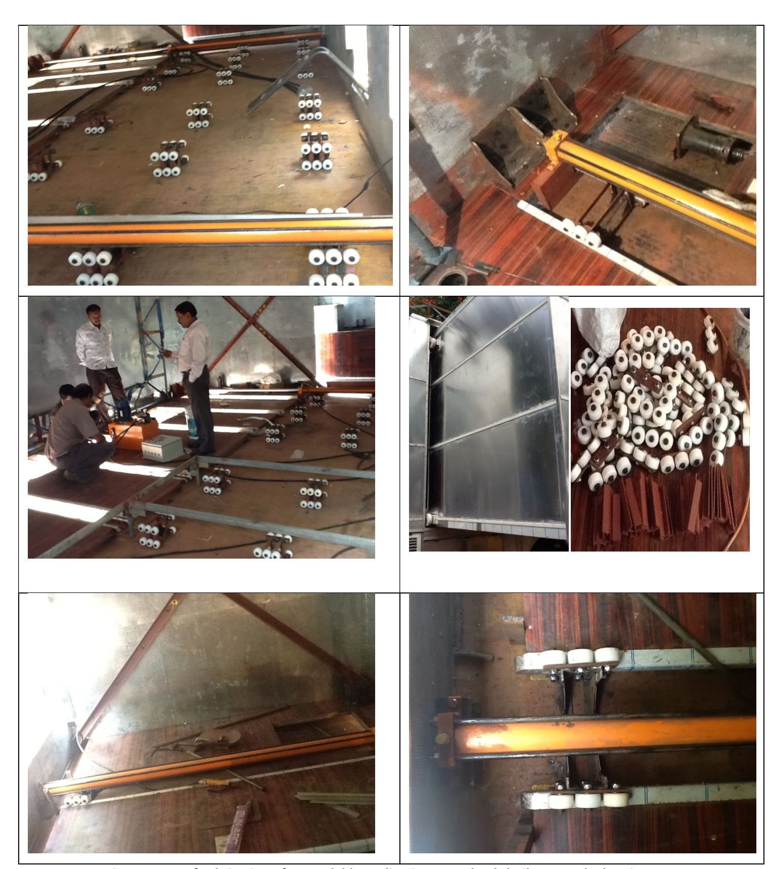
Various Stages of Fabrication of Expandable Auditorium on Wheels built on Truck Chassis